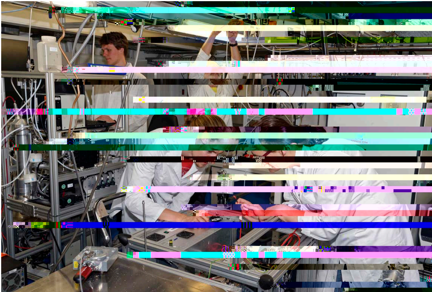
Scientists at the LEAK cloud chamber, Leibniz Institute for Tropospheric Research