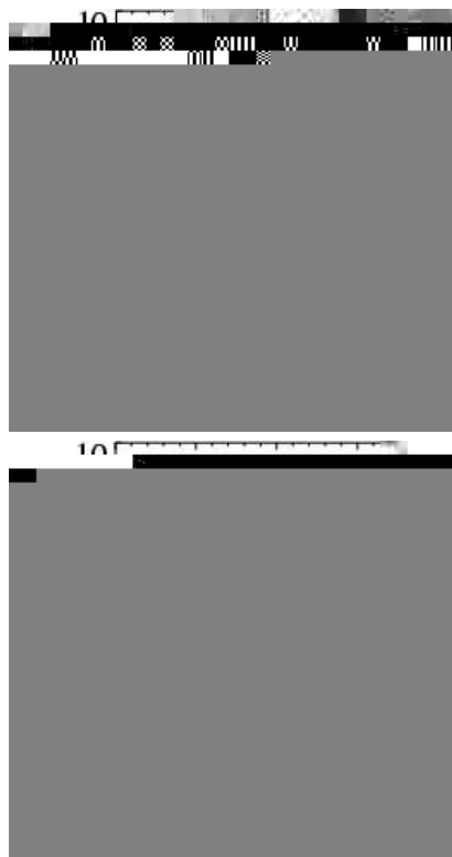
Figure 1: Scatterplots of the change in global mean methane concentrations with global water mass and global mean OH levels. The data have been detrended and scaled so that they lie on the same axes. The units are arbitrary.

vapour levels in the troposphere with increasing temperature.